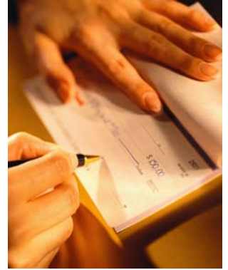
Track your Religious Education Tuition and Fees using the CMS Contribution System.

Just remember, you do not want to print this fund on your End of Year Contributor Statements, as this is not a deductible fund.