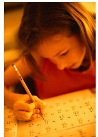
Use all of CMS to track your Religious Education Programs

each day of class and if the absence was excused or not-excused. You can also contact the parents of the kids who consecutively miss a certain number of classes.