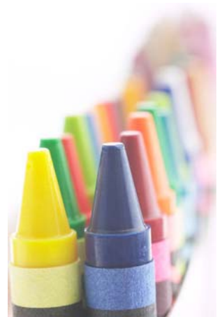
Save time and effort each year

Then, again in the fall, you can quickly advance your students from one class to another using the Advance to Next Class process in Membership. This will save you time and effort each year!