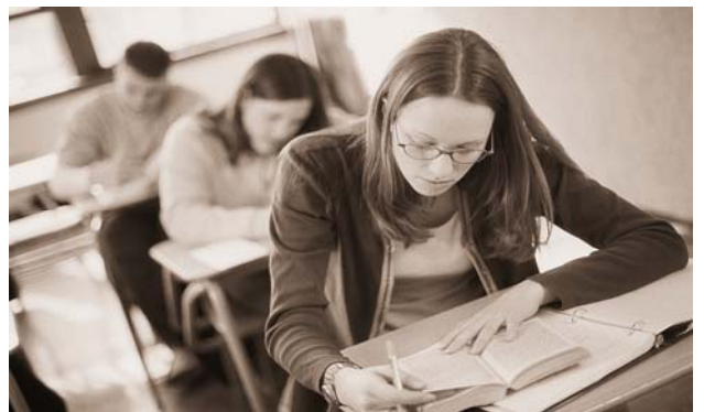
Wouldn't it be nice to track if the kids are actually showing for class?

"You will receive one statement for the RE Program participating families indicating their Tuition and Payments towards that fee."